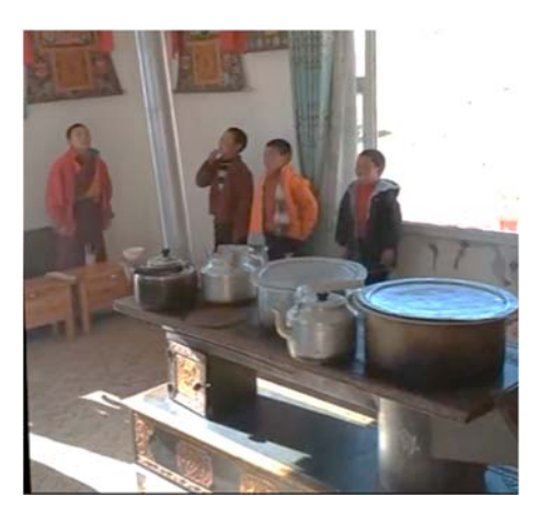
Photo (bottom) The stove sits in the center of the classroom and used for boiling water, cooking and keeping the space warm.

Sorry for the poor quality of the photos, which were sent to us via cell phone in June 2022.