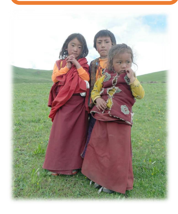
Education At Elevation Mission: Enriching the Lives of Impoverished Children in Eastern Tibet.