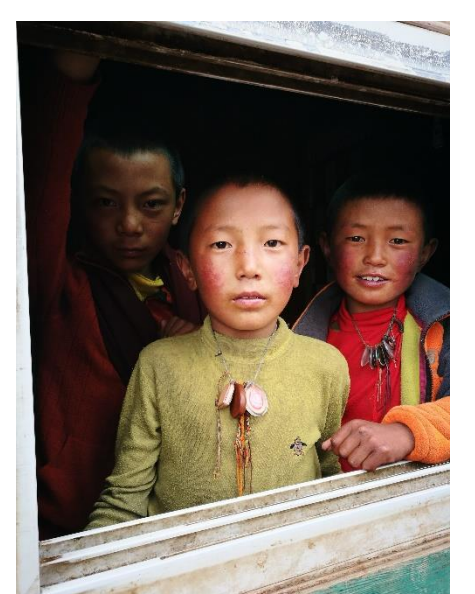
Kids looking out from their room (L).

New school building (R). Exterior is done and interior to be completed in 2020.